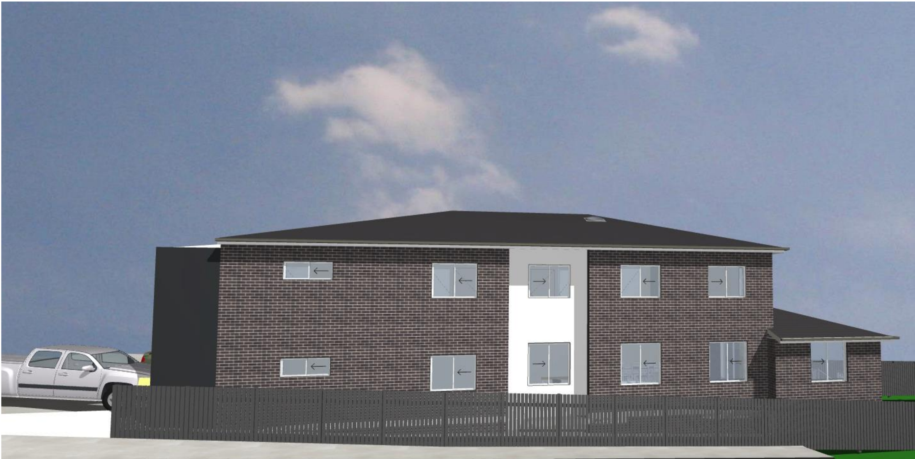
SIDE VIEW (NORTH) PERSPECTIVE