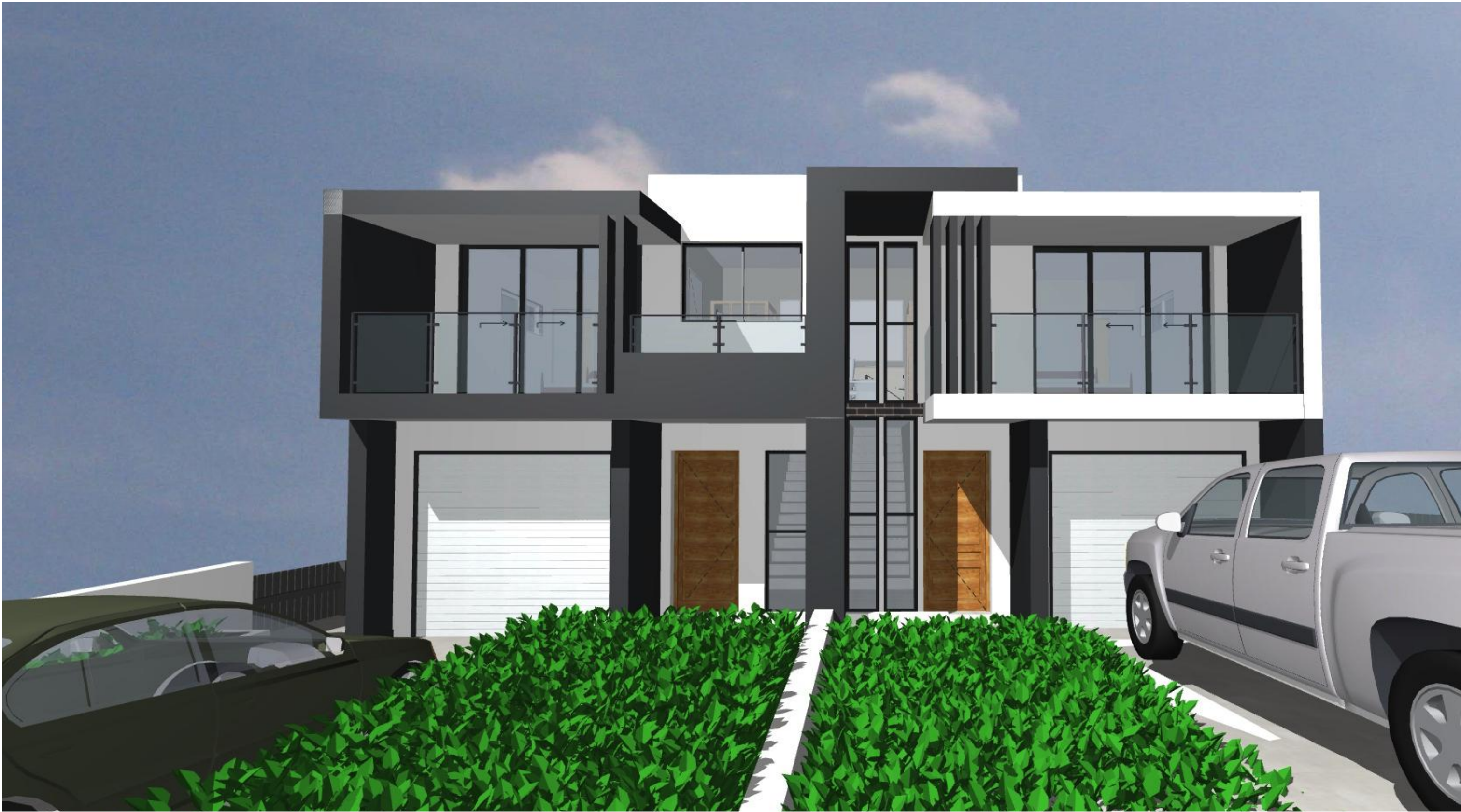
FRONT VIEW PERSPECTIVE