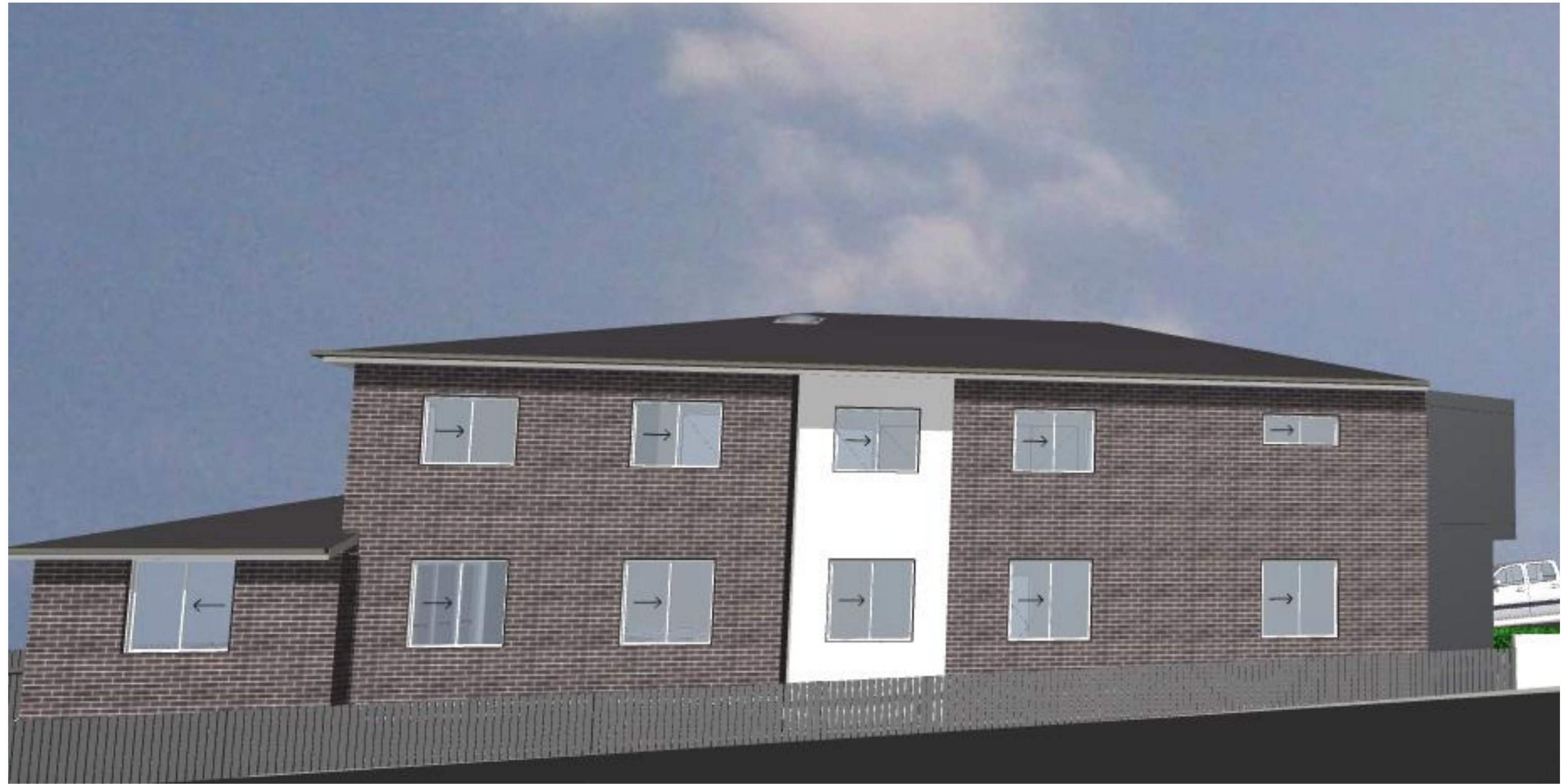
REAR VIEW (SOUTH) PERSPECTIVE