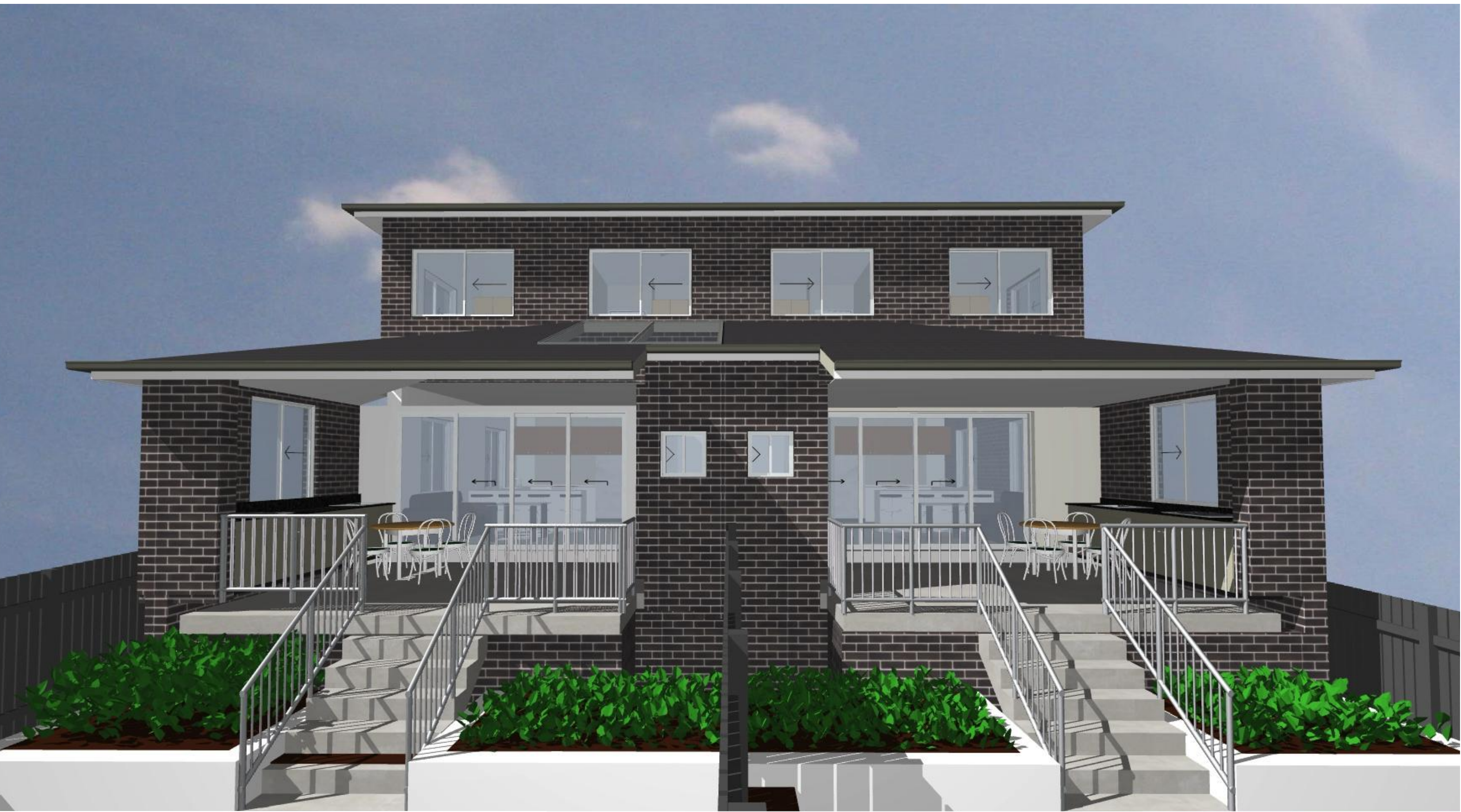
REAR VIEW PERSPECTIVE